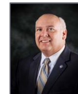
Sen. Michael Skindell

The Bill of Rights and Voting Committee shall serve as a subject matter committee for the purpose of reviewing the provisions of Article I (Bill of Rights) of the Ohio Constitution dealing with the rights of all, including Sections 1, 2, 3, 4, 6, 7, 11, 13, 16, 17, 18, 19, 19b, 20, and 21. In addition, the Committee shall review the provisions of the Ohio Constitution