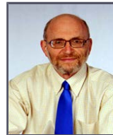
Richard B. Saphire Chair