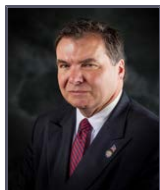
Sen. Bill Coley